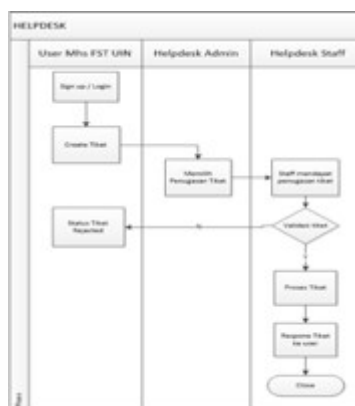
Tabel 2. 1 Table design helpdesk